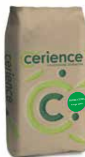
Packaging: Bag of 15 kg

Scores refer to registration trials performed in France. They range from 1 (very low) to 9 (very good). 2021•Non-contractual document. This document is provided for information purposes only. Recommendations may vary according to local soil and climate conditions and local agricultural practices.