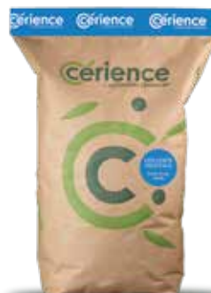
PACKAGING Bag of 10kg